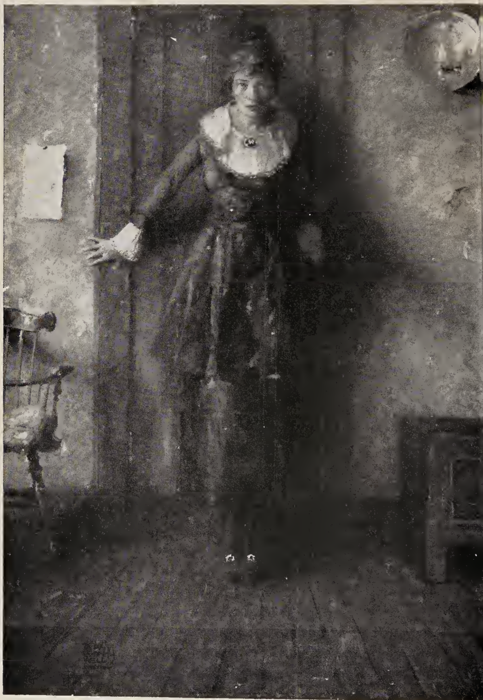
The mystery girl had entered and closed the door.